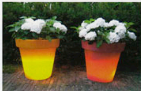
Clockwise from top: Coro Collezioni stainless steel planters from Italy are available as cylinders or as boxes. The cast concrete Litho planter, made in Vancouver, comes in chalk or shale. The plastic Bloom pot is light in every way. Victoria concrete artist Billie Bjornert's planters are handmade and unique.